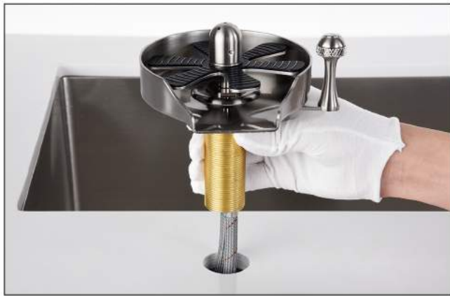
1. Place the glass inser and hoses into the predrilled hole for installation.