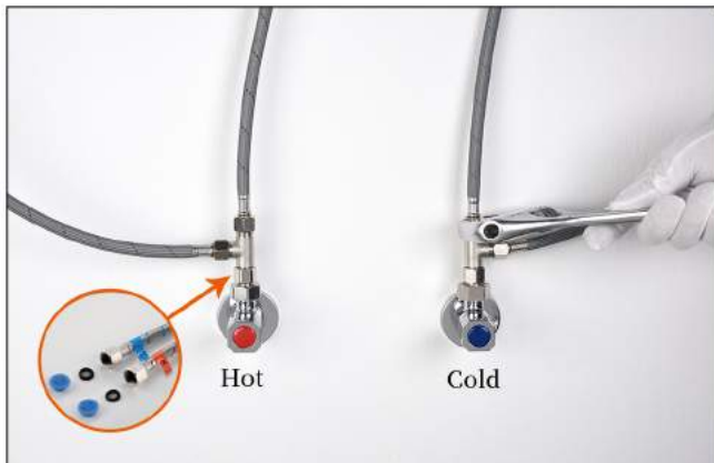
5. Connect the water supply lines to the shut off valves. Make sure the washer is on the brass nut.