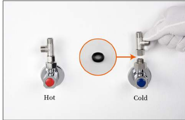
4. Connect the fitting to the shut off valves. Make sure the washer is on the side.