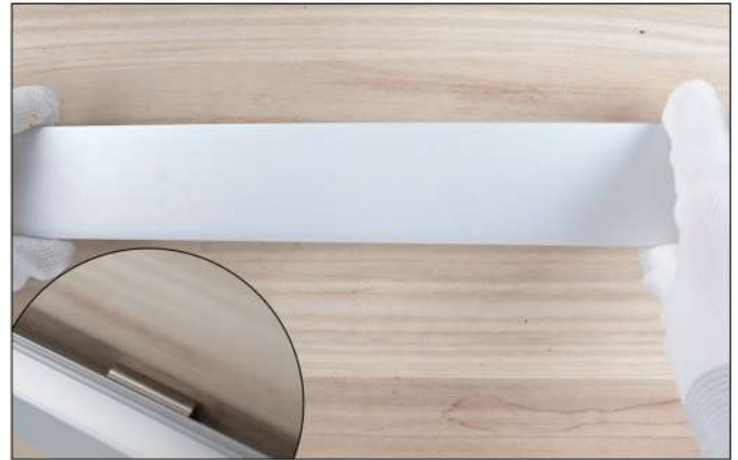
Step 2 - Install the aluminum channel