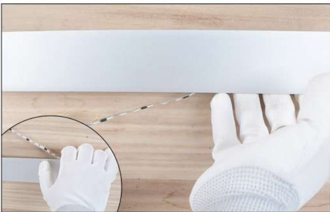
Step 3 - Attach the LED strip to aluminum channel