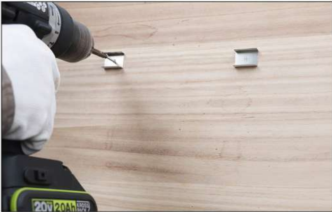
Step 1 - Fix brackets with screws