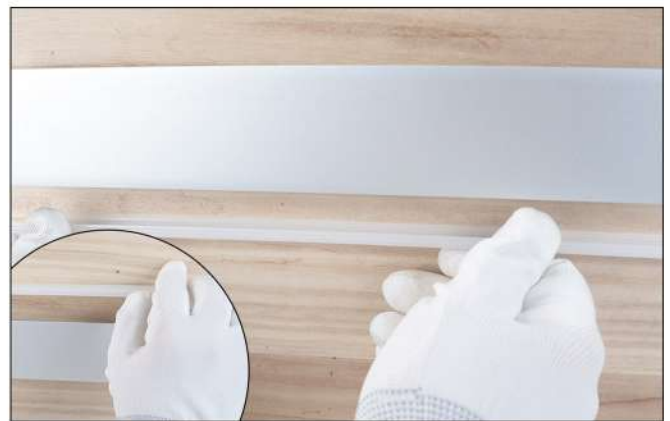
Step 4 - Press the cover into aluminum channel