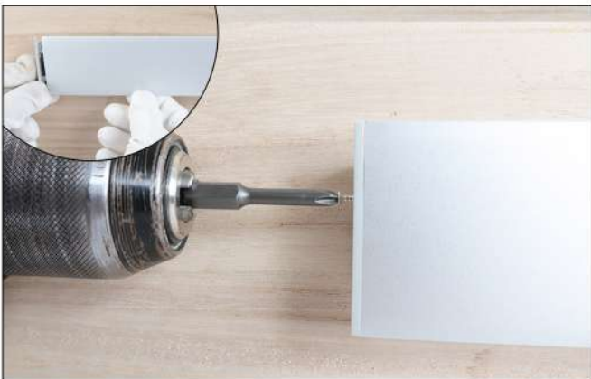
Step 5 - Fix end caps with screws