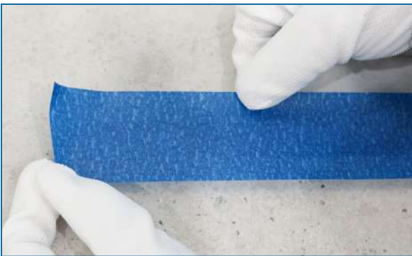
Step 3 - Cover the channel with painter's tape.