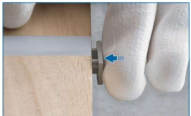
Step 8 - Install the end caps (apply silicone sealant as well).