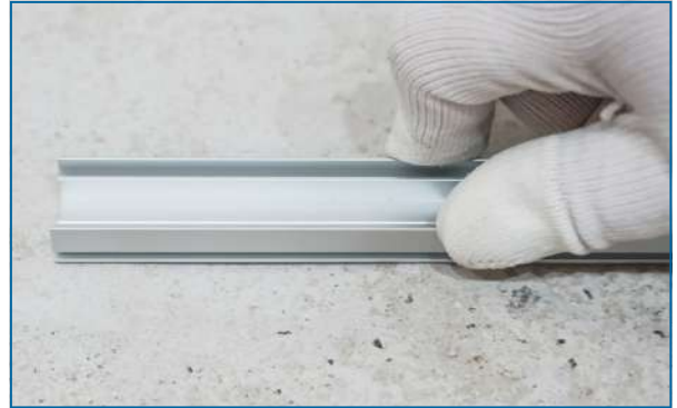
Step 2 - Fix the aluminum channel (Hold until it is firmly in place).