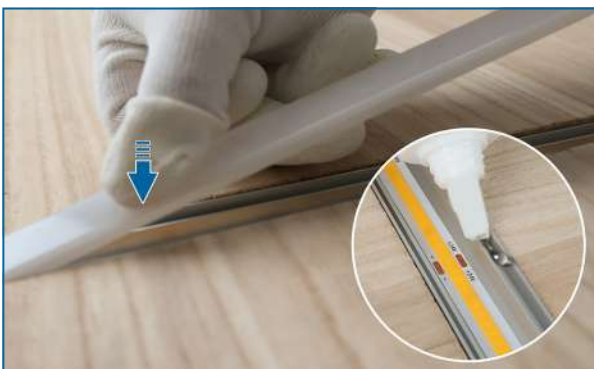
Step 7 - Apply silicone sealant to the in-side channel, then press the cover.