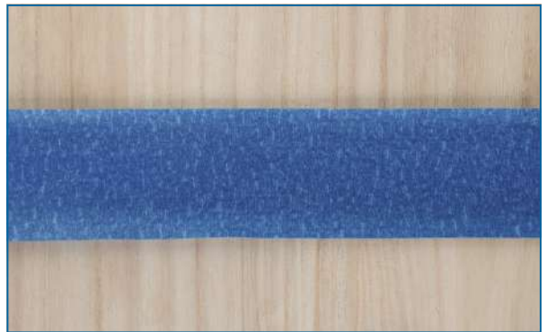
Step 4 - laying the floors.