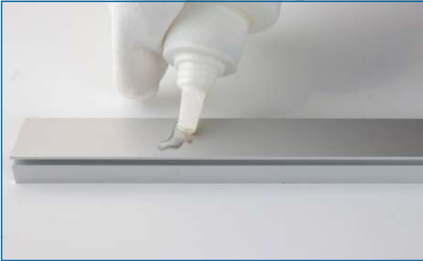
Step 1 - Apply silicone sealant on the back of the channel.