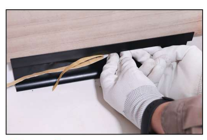
Step 4 – Attach the LED strip to aluminum channel