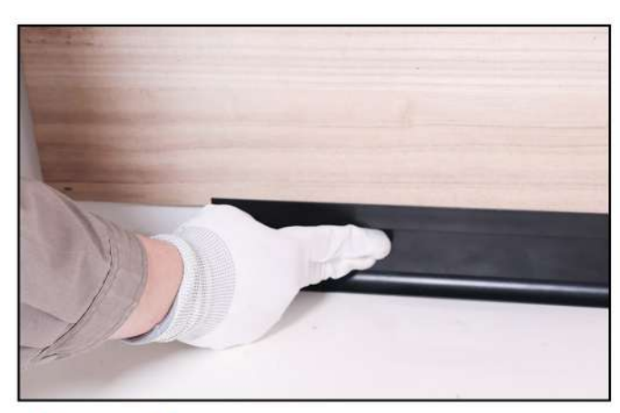
Step 3 - Attach the channel on the wall (Hold until it is firmly in place)