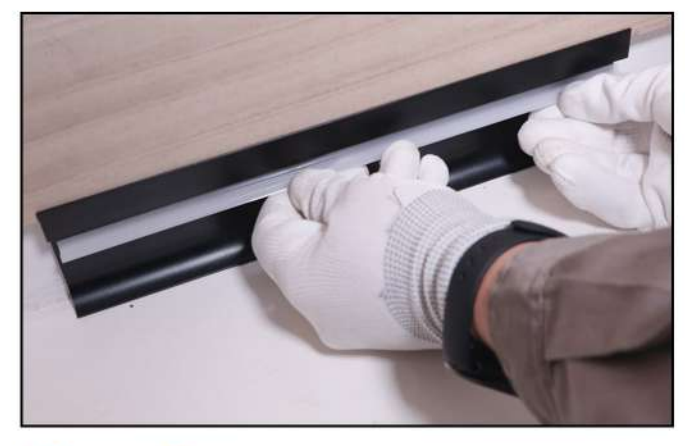
Step 5 - Press the cover into the channel