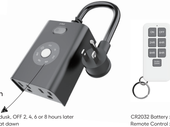
CR2032 Battery x 1 Remote Control x 1