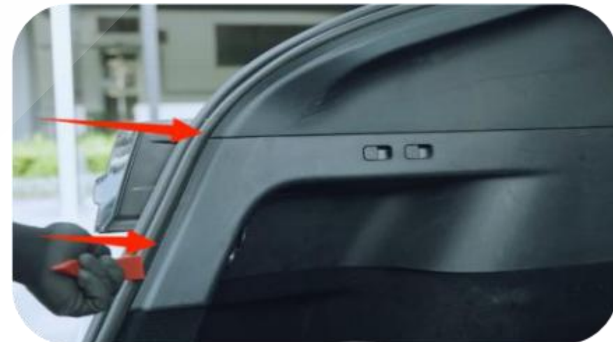
4. Use plastic trim removal take off the left trim of the trunk