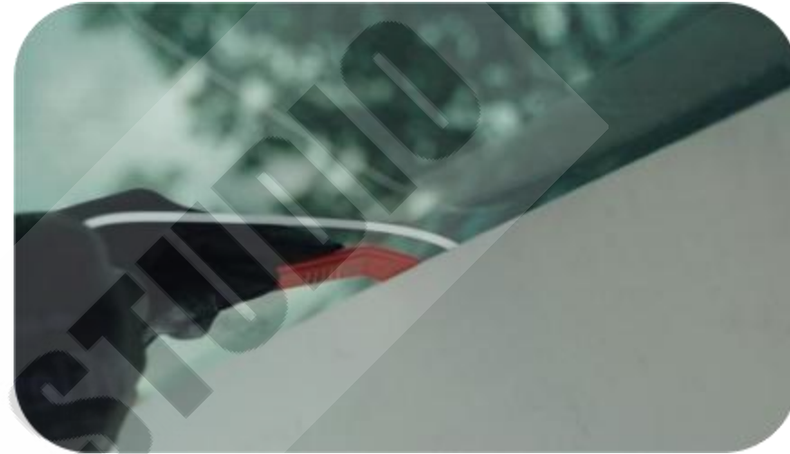
10. Glass position on the top of the back window