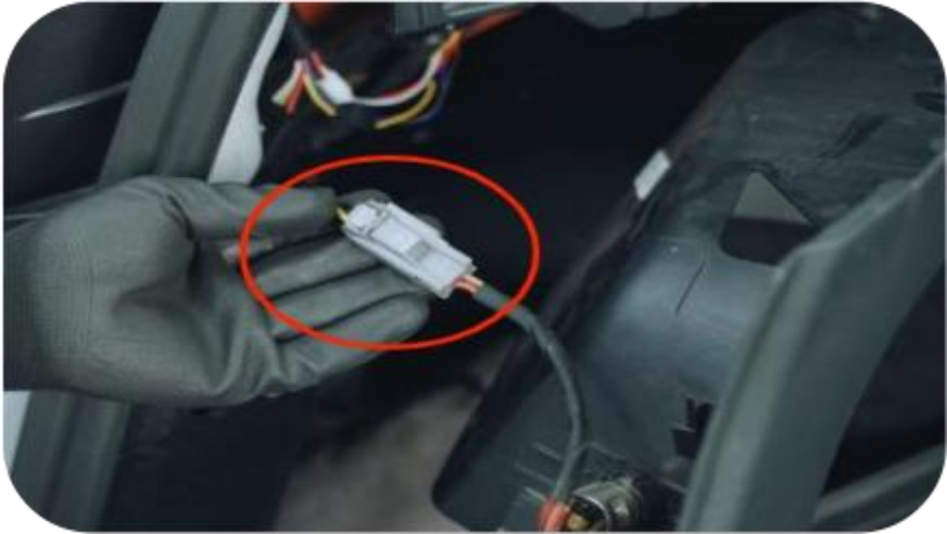
5. After remove the trim, find the plug of the original car cigarette lighter