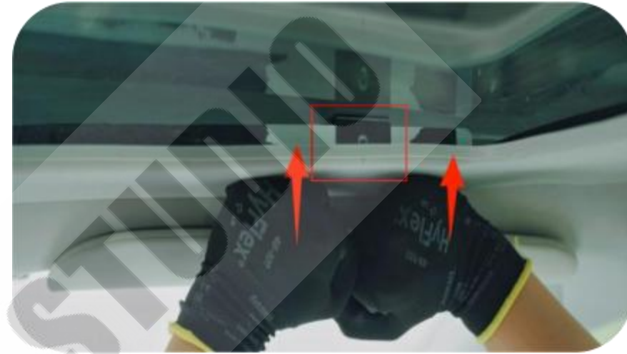
18. Need to push the shade up the top, as shown in the figure, align the screw eye (left and right the same)