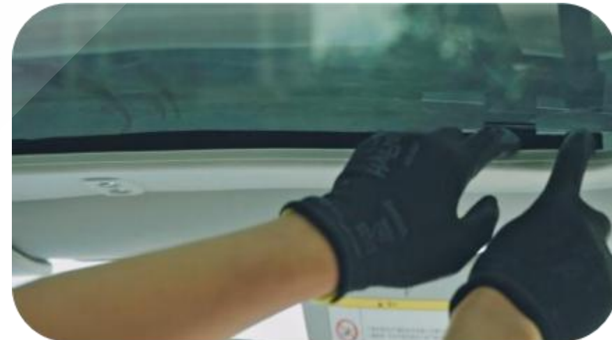
20. Cover the bare parts of the front seat like silver (Restoration is enough)