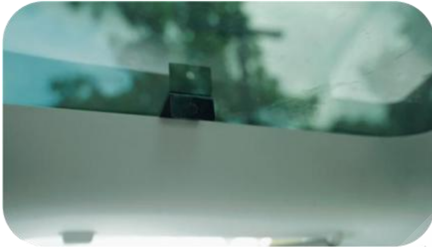
17. Insert the bolt (left and right the same)