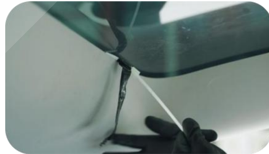
12. Pull down the upper glass in the back window and untie the tape