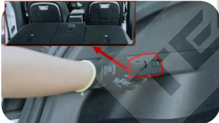
3. Press the rear-seat button from the trunk