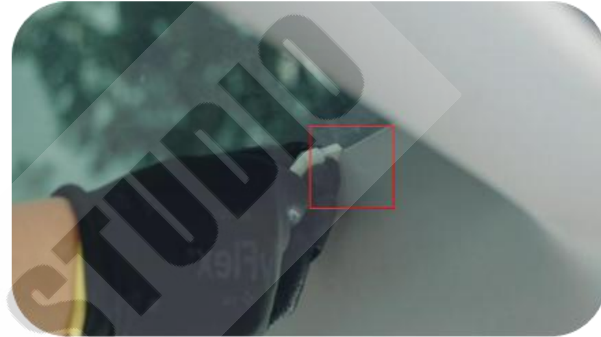
14. Connect the plug on the motor into the power plug that passes through the front (hide the plug in the roof).