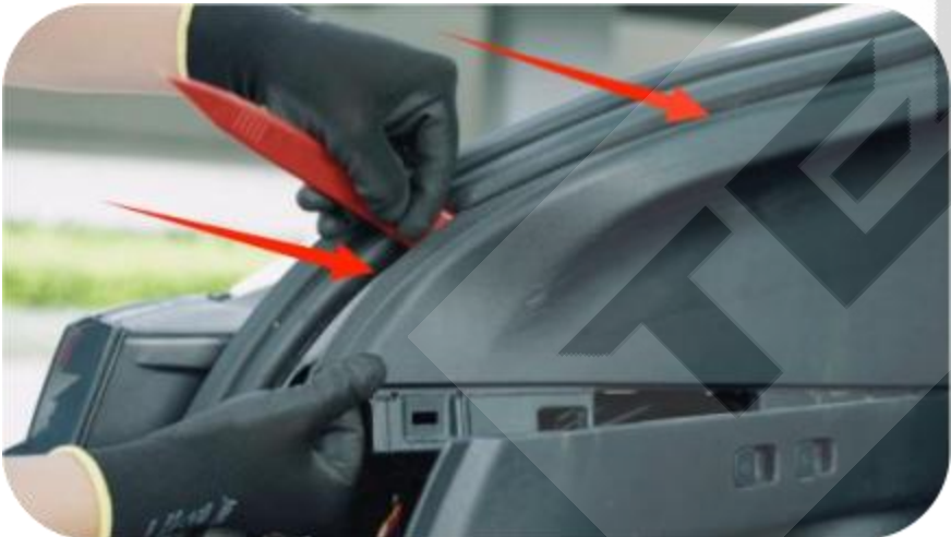
7. Take off the upper left panel