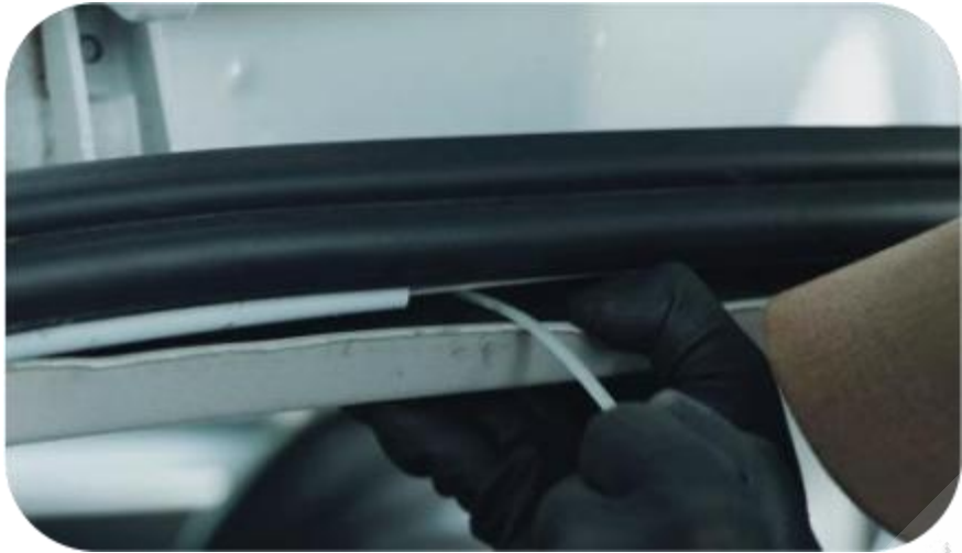
9. Use the threading tape from the back to the back window