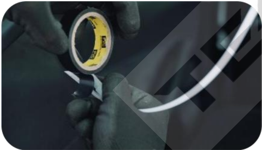
11. Use tape to tie the power plug to the back of the threading tape