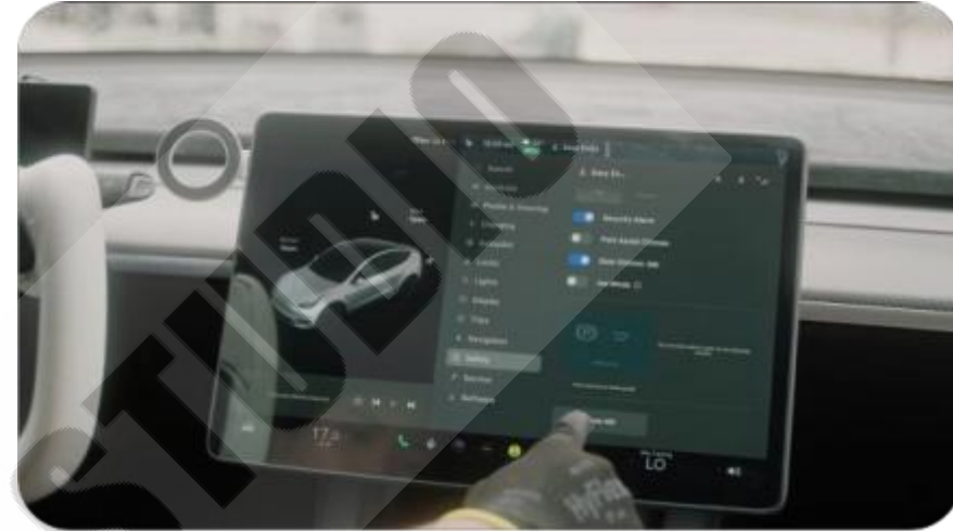
2. Turn off the main power in the vehicle setting