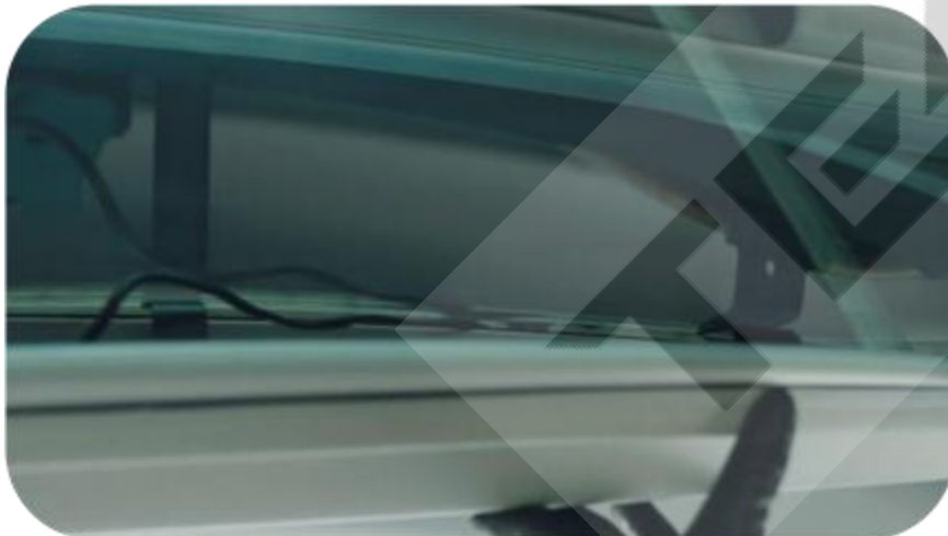
15. Insert the pin behind the shade curtain into the rear trim board (hold it after inserting)