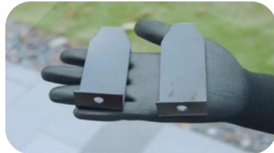
16. Insert these two latches into the gap between the glass and the trim above the front seat (left and right).