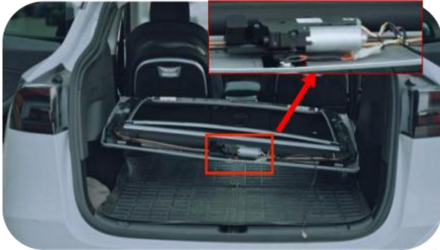
13. Lift the shade into the car (two people are recommended to operate)