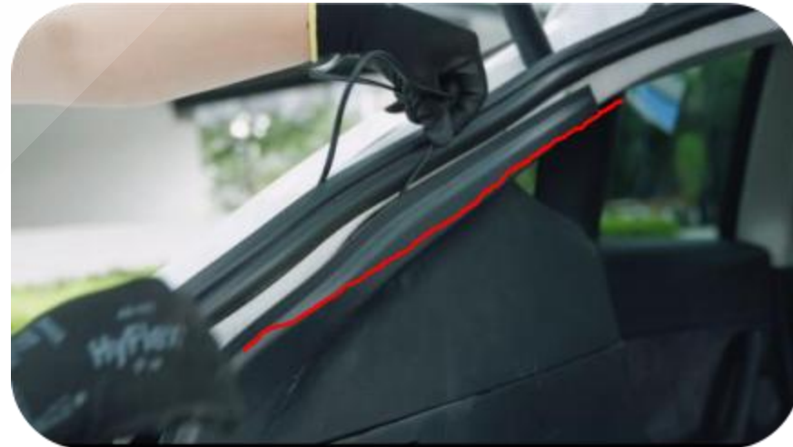
8. Move the harness to the top