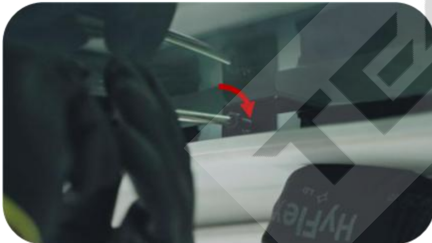
19. Use a Phillips screwdriver to screw (left and right the same)