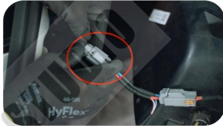
6. Connect with our products wiring harness