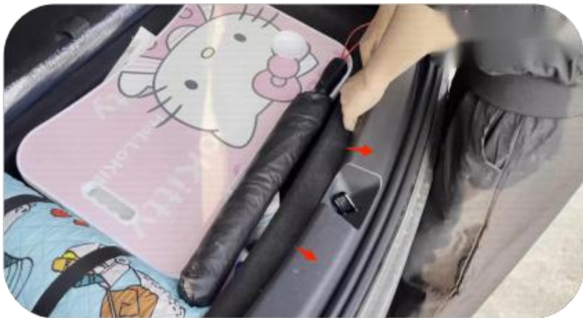
1. Remove the trunk trim panel