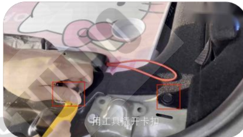
2. Remove the clips (The same applies to the left and right)