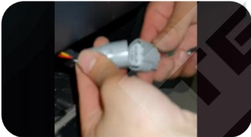
7. The pilot light and the extension harness plug are plugged into each other.