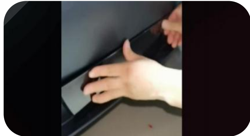
8. Align the position of the original car and insert the pilot light.