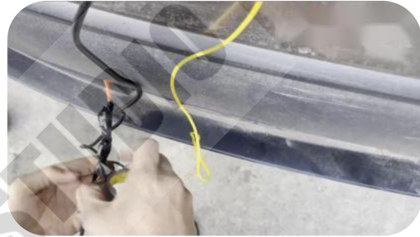
6. Tie the extension harness on it, and then pull it to the tail light position