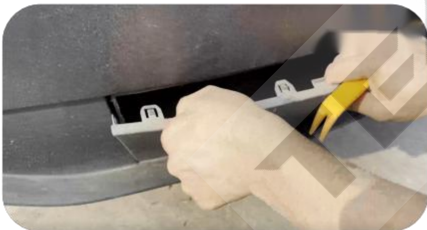
3. Remove the rear tow hook cover