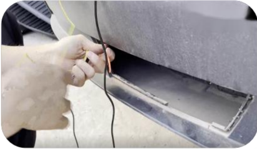
5. Pull the fish tape to this position