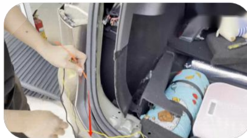
4. Use the fish tape to pass through the gap inside the door seal to the position of the rear under cover