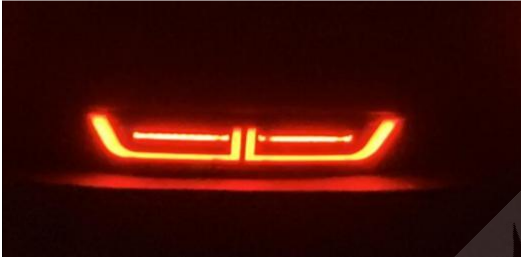
Cyber Pilot Light