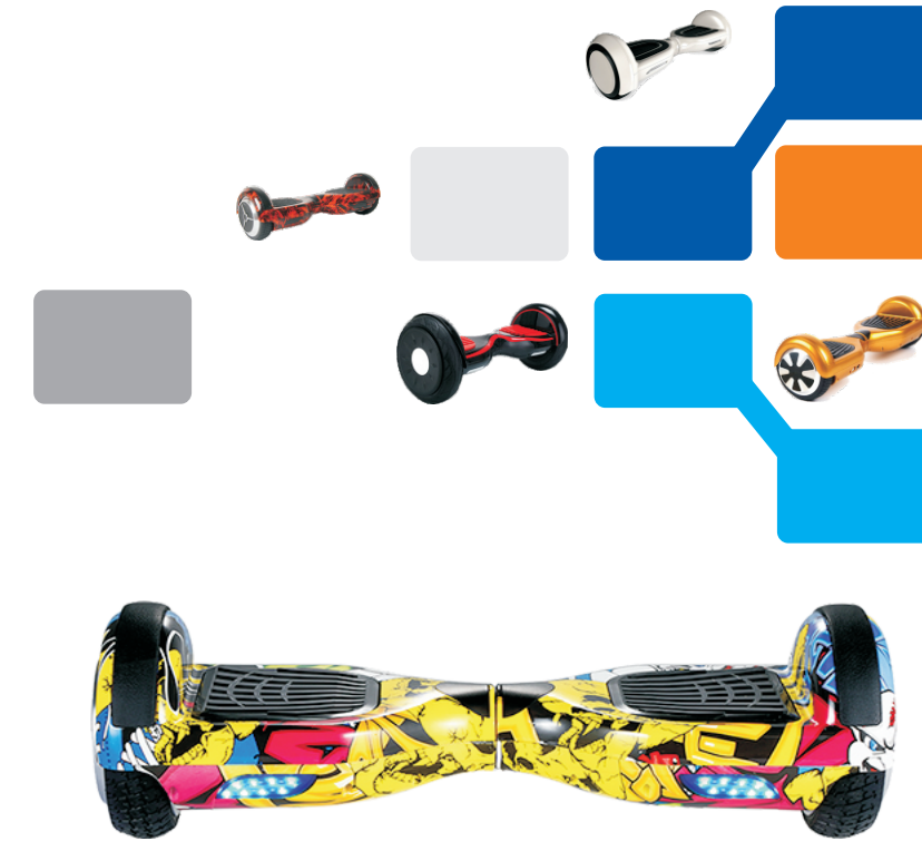
PICTURE IS FOR REFERENCE ONLY.THE SPECIFIC KIND PREVAIL.