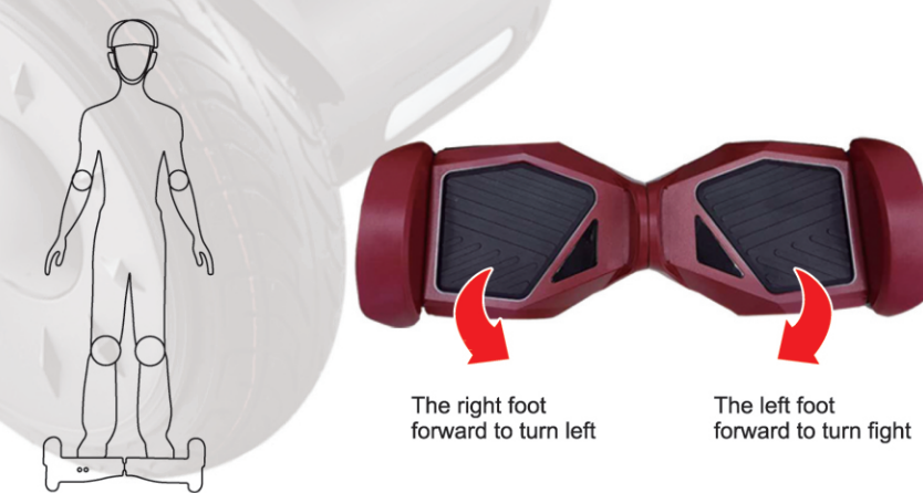
The right foot forward to turn left The left foot forward to turn right