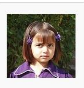
Chestnut brown hair