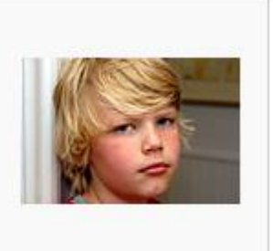
Medium blond hair