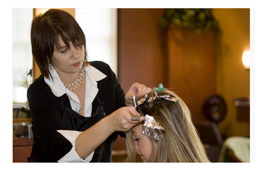
A hairdresser colors a client's hair.

Permanent hair color means that the hair's structure has been chemically altered until it is eventually cut away. This does not mean that the synthetic color will remain permanently. During the process, the natural color is removed, one or more shades, and synthetic color has been put in its place. All pigments wash out of the cuticle. Natural color stays in much longer and artificial will fade the fastest (depending on the color molecules and the form of the dye pigments)