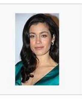
Deepest brunette hair