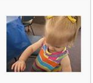
Golden blond hair