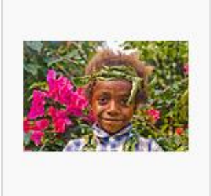
Light brown hair