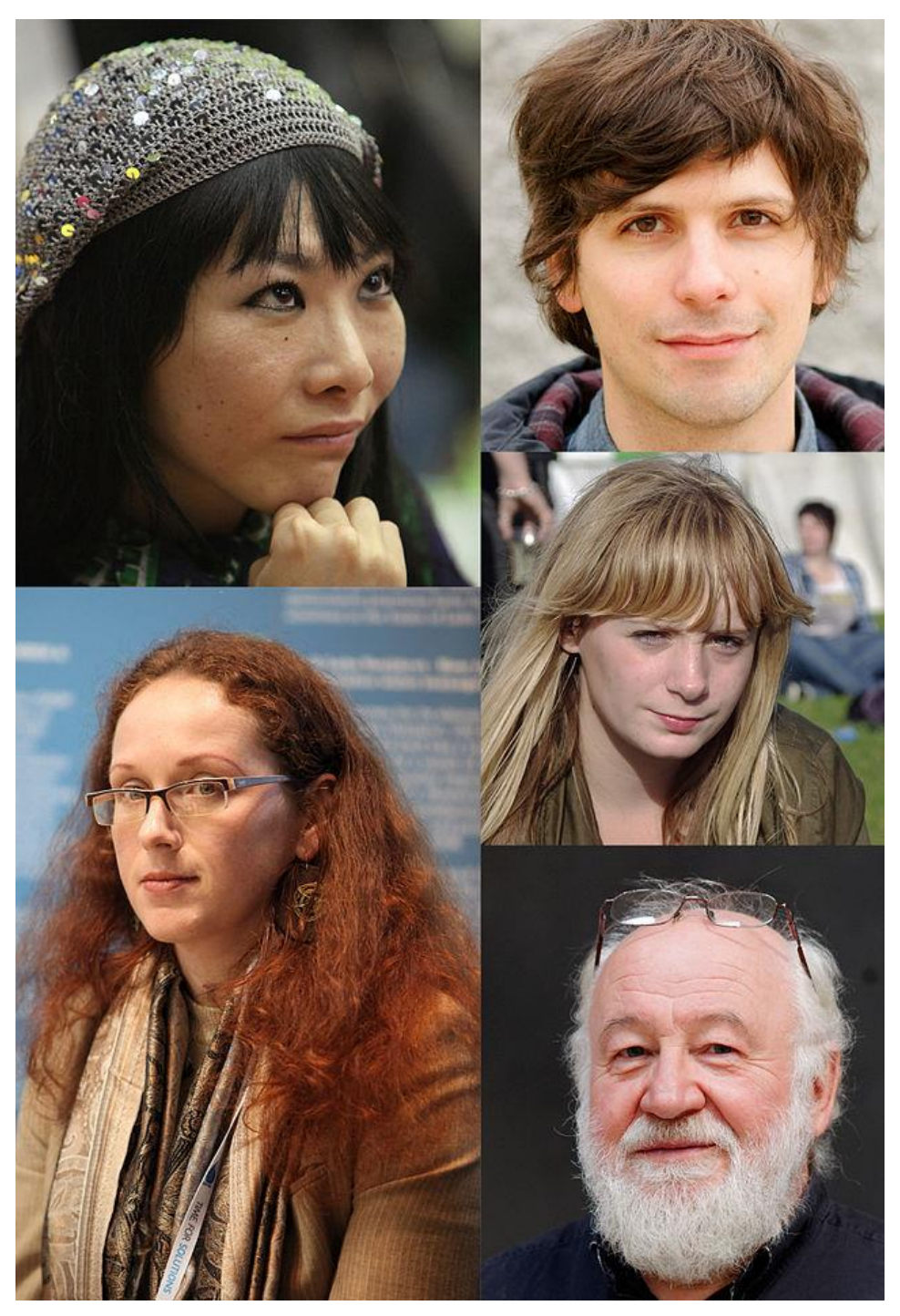
A variety of the hair colors. From top left, clockwise: black,brown, blonde, white, red.

Hair color is the pigmentation of hair follicles due to two types of melanin: eumelanin and pheomelanin. Generally, if more eumelanin is present, the color of the hair is darker; if less eumelanin is present, the hair is lighter. Levels of melanin can vary over time causing a person's hair color to change, and it is possible to have hair follicles of more than one color.