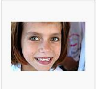
Light chestnut brown hair