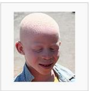
White hair caused by albinism