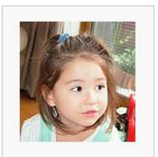
Natural brown hair