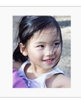
Natural black hair