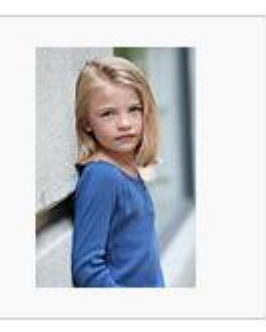
Light blonde hair